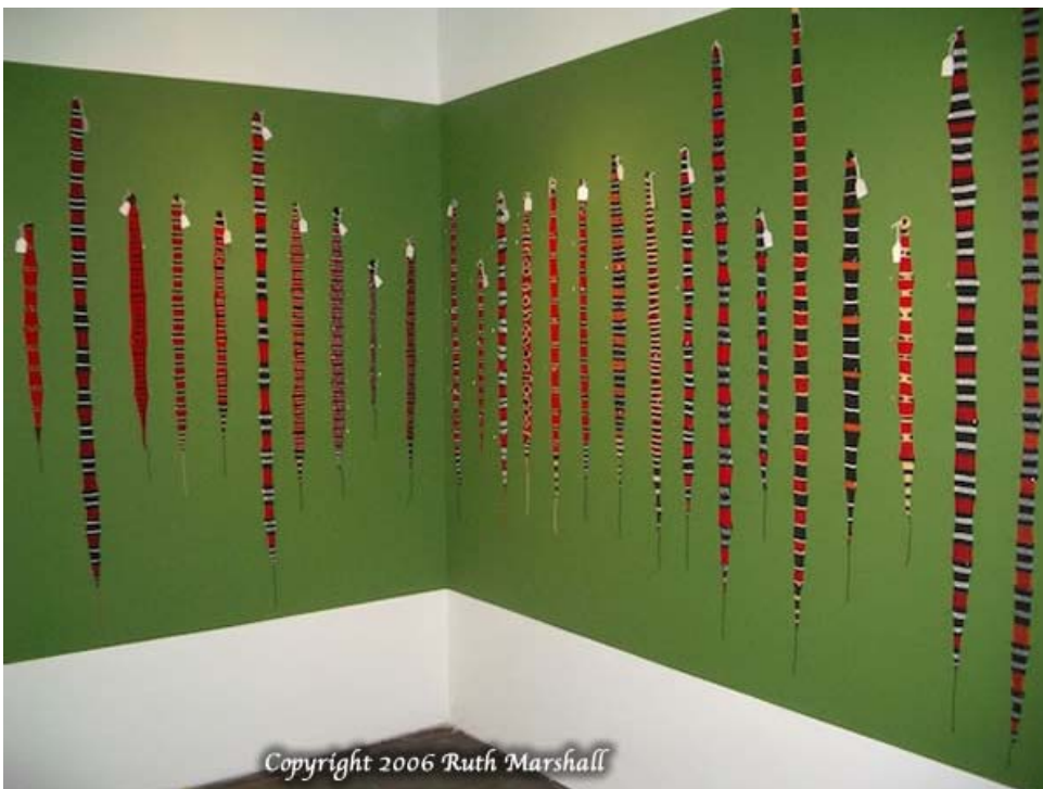
Coral Snake Series, 2006, exhibited at Dam, Struhltrager Gallery, Brooklyn

(Artist: Ruth Marshall , Courtesy of Dam, Å Stuhltrager Gallery )