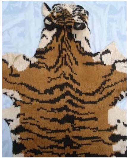
Tiger Cub, knitted yarn, 2010