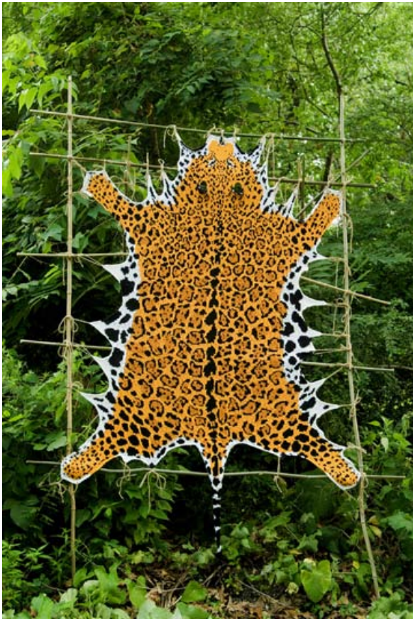
Gold Jaguar, knitted yarn bamboo and string, 2007