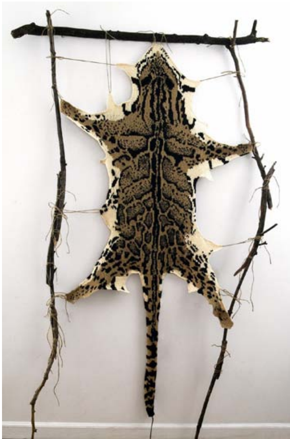
Clouded Leopard (from the Small Cat Series), Å hand knit wool yarn, wooden frame, twine, 2009

(Artist: Ruth Marshall)